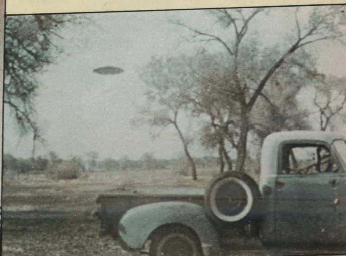
Left, UFOs or lenticular (shaped like a lens) clouds - which look like UFOs - seen in Taormina, Sicily, in 1954. Above, possible UFO seen in Albuquerque, New Mexico, on 18 April 1965