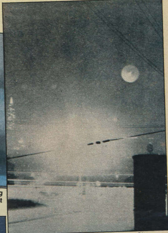
Strange object seen over New York City at 11pm on 28 July 1952