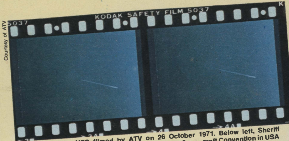
Above, possible UFO filmed by ATV on 26 October 1971. Below left, Sheriff Ackerman holding pictures of spacecraft at Annual Spacecraft Convention in USA