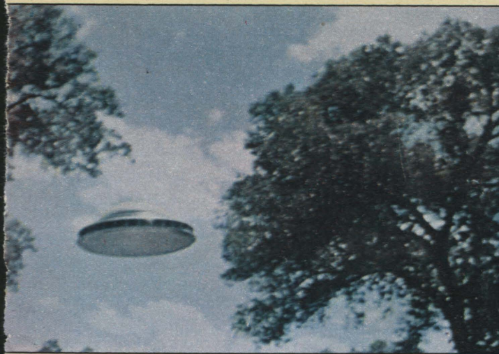
Above, possible UFO seen in Peralta, New Mexico, on 16 June 1963