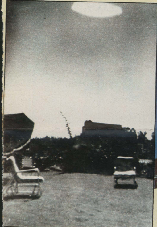
Left, seen in Escondido, California at 10am on 10 July 1956 was this object: 60m in diameter, 13m in height, hovering at about 300m. Above, cloud seen in Phoenix, Arizona, in 1957. Right, UFO-like cloud from 'Mysterious World' book